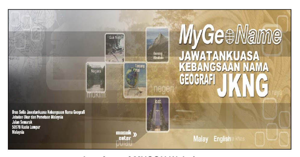
Interface of MNCGN Website

Training Course on Toponymy and Information Bulletin of UNGEGN, December 2012. This website can be accessed at http://www.jupem.gov.my/Geonames/splash.aspx in dual language that is in Malay language and in English language. Through this website, all information related to geographic naming activities could be accessed and is linked to UNGEGN website and other country websites which are related to the geographical naming such as New Zealand, Australia, United States and Canada. This website also include of Frequently Asked Questions (FAQ). A list of liaison officers for each agency is also included for communication purpose.