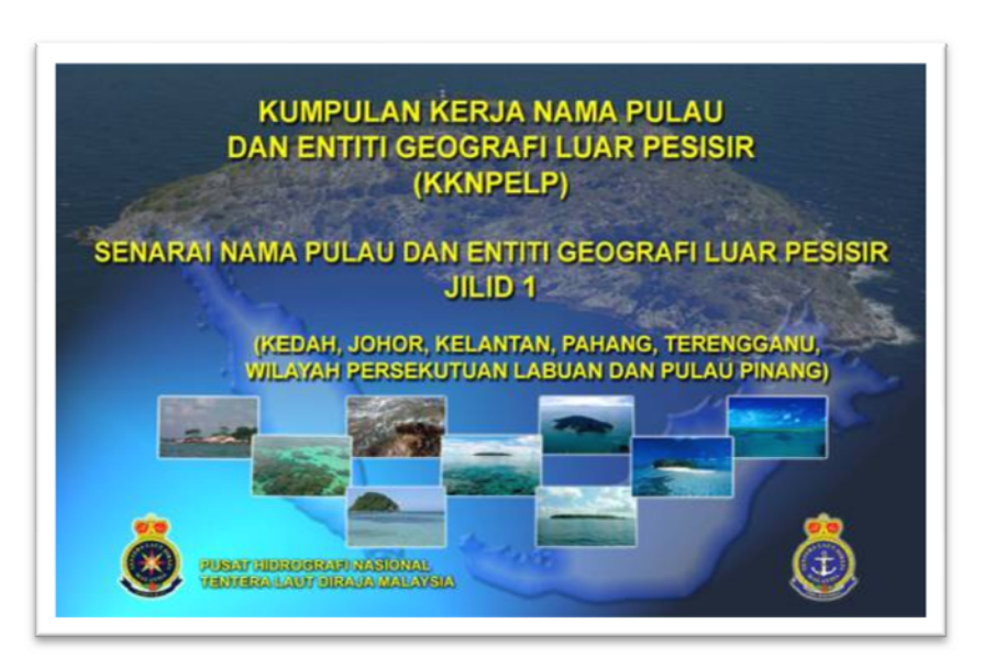
Names of Islands and Off-Shore Geographical Entities Document