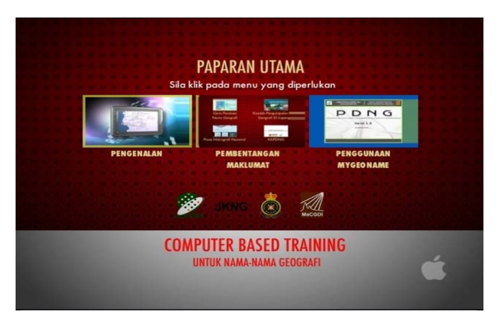
Interface of CBT

All of the topics that were presented during the workshop are also included in the Computer Based Training (CBT) for geographic naming. The purpose of this CBT is to educate and illustrates the significance of geographic naming in the country for officers from Federal Agencies, State Agencies and Local Authority.